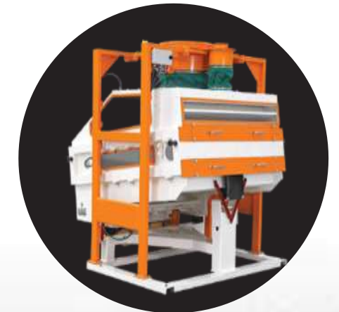
STONE SEPERATOR IMAS