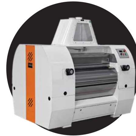
MILLENIUM ROLLER MILL

E & U Foods (Pvt) Ltd plant will utilize this equipment in their milling to produce flour of the highest possible quality. Milleral's products are sold all over the world and their high technology products help the plant to keep up with international standards of milling.