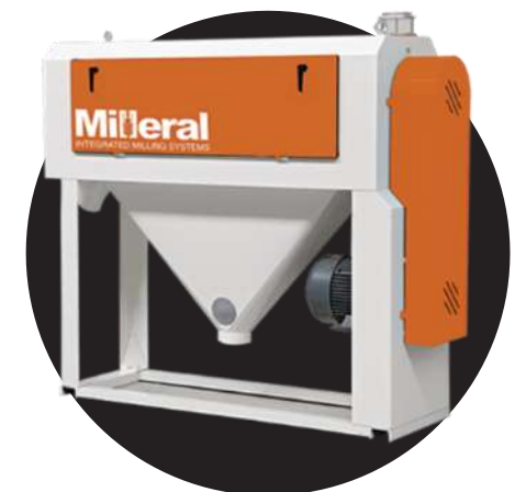
WHEAT IMPACT SOURCER