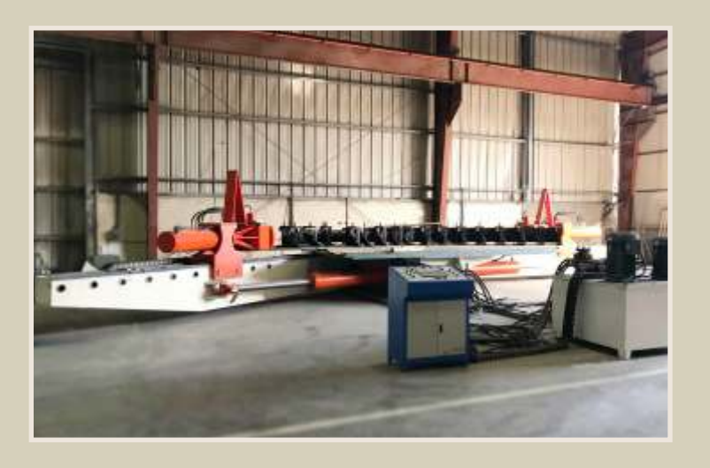
PULL BENDING MACHINE