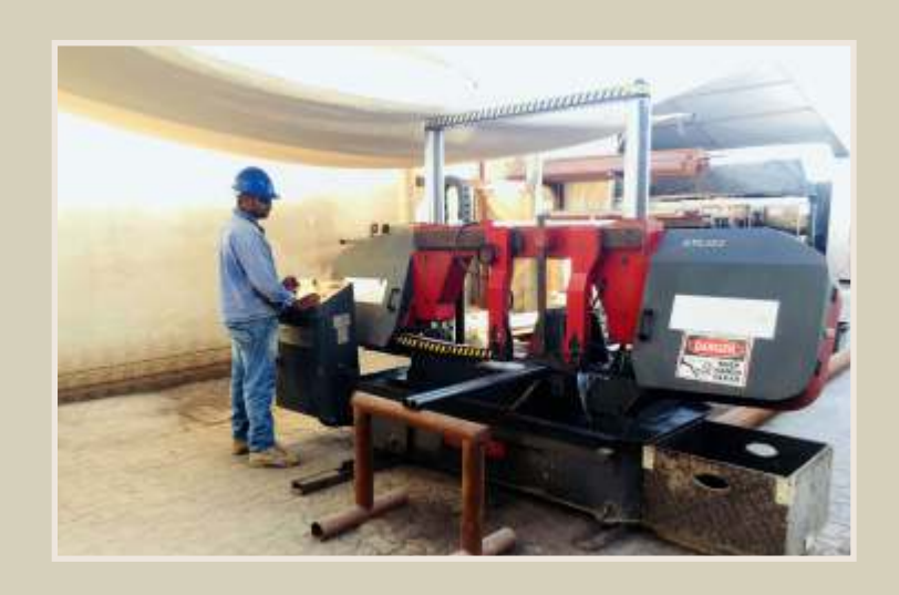
BAND SAW CUTTING