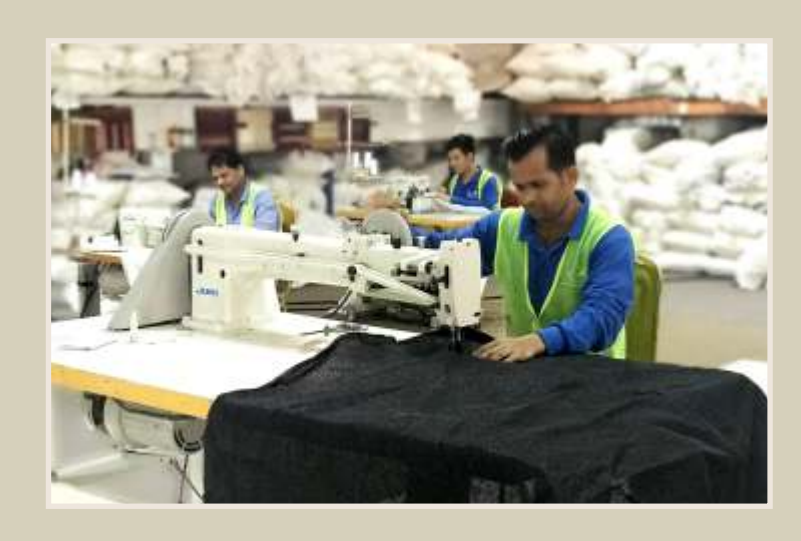
GERBER CUTTING AND MARKING