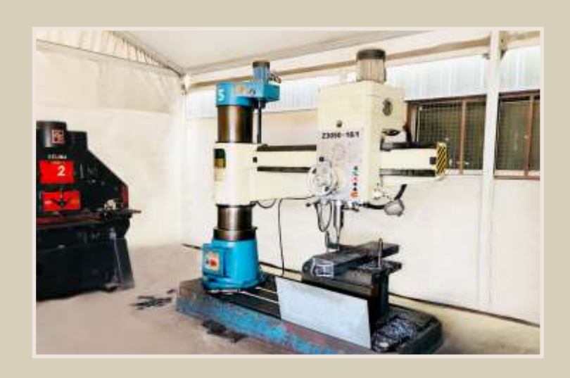
RADIAL DRILL (SAYES)