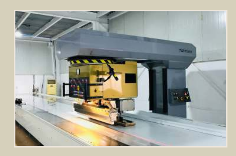
FORSSTROM PVC WELDING TG-FLEX