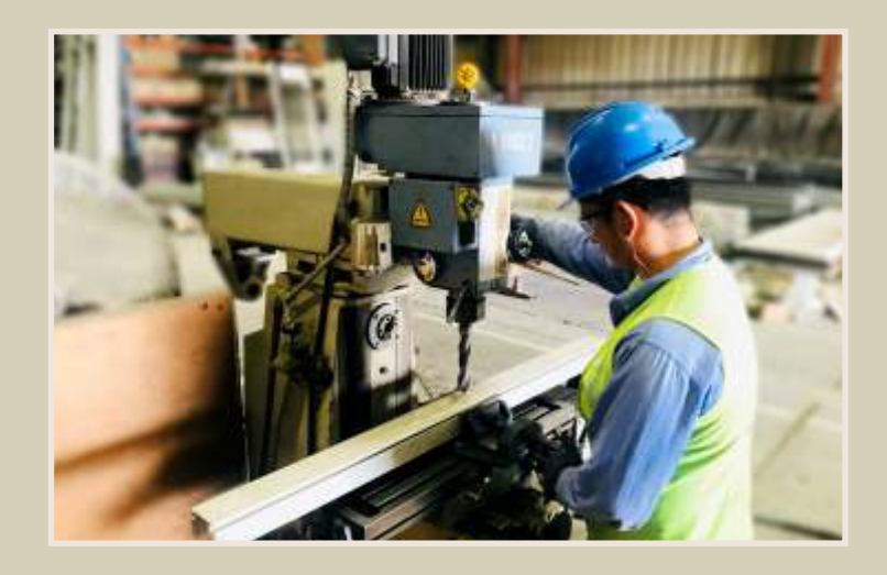
MILLING & DRILLING