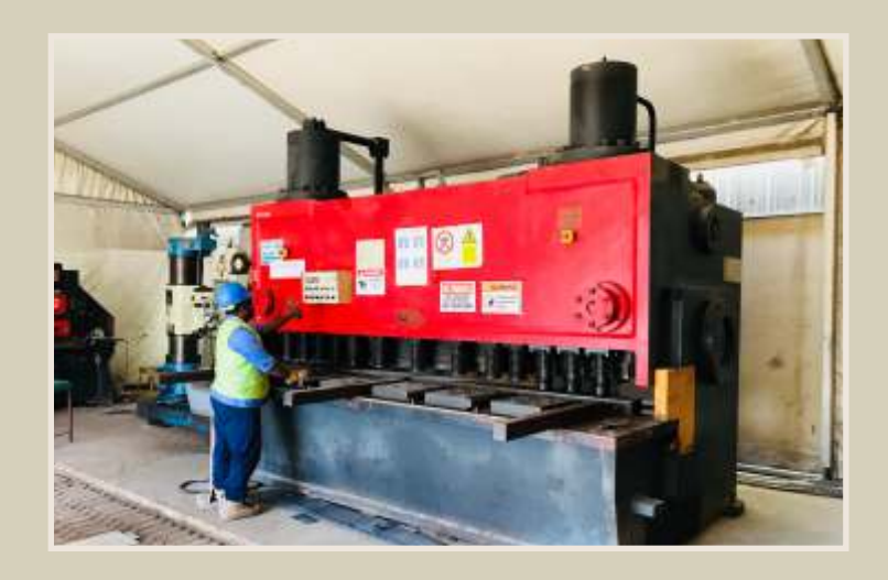
HYDRAULIC SHEARING MACHINE (SAYES)