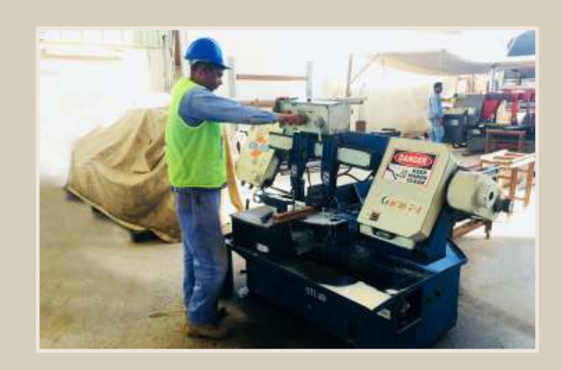
BAND SAW CUTTING