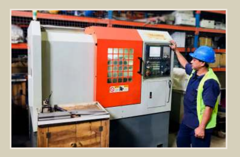
HEADMAN CNC LATHE