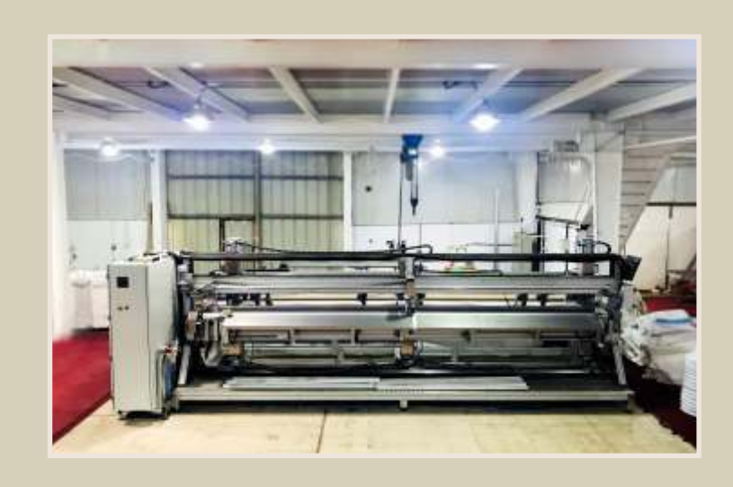
S.M.R.E PVC WELDING MACHINE