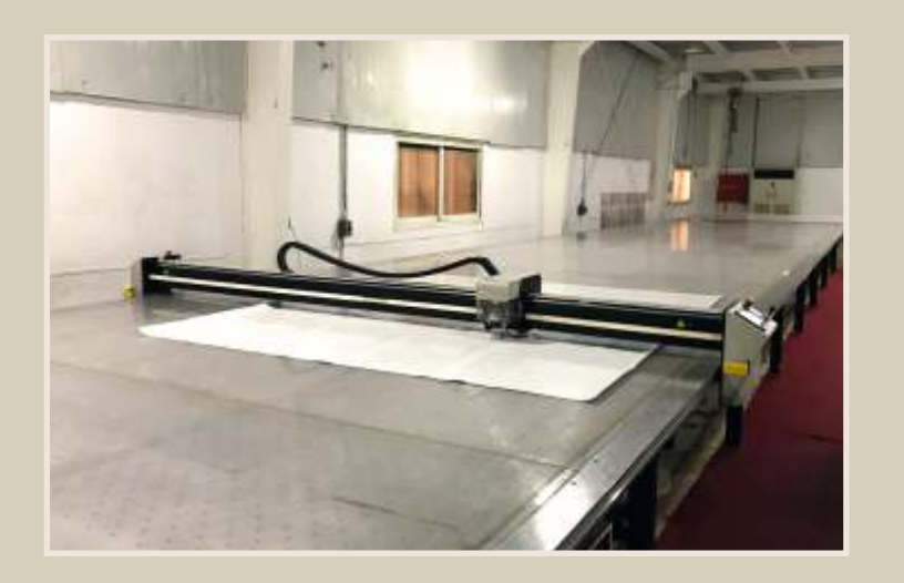
GERBER CUTTING AND MARKING