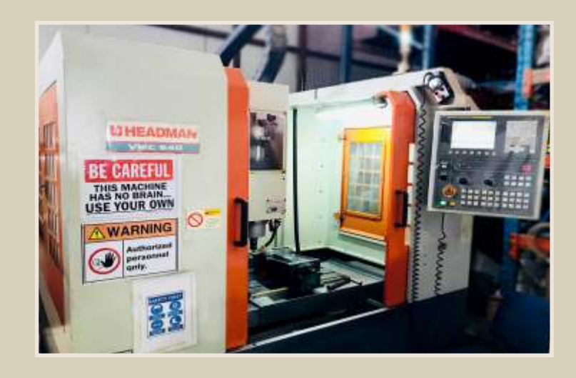
HEADMAN CNC MILLING