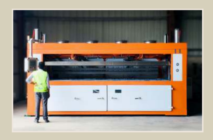
ABS THERMO FORMING MACHINE