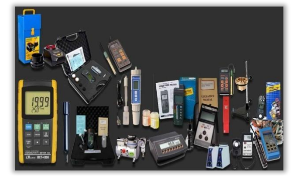
Laboratory Testing Equipment