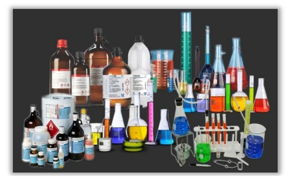
Laboratory Glassware & Chemical