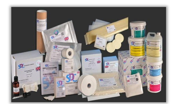
Textile Testing Consumable