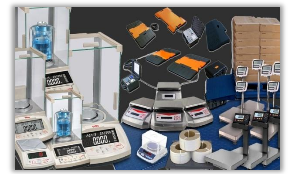
Electronic Weighing Scale & Balance