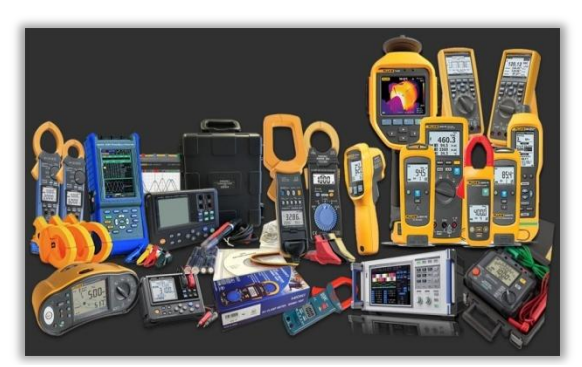
Electrical Measurement Equipment