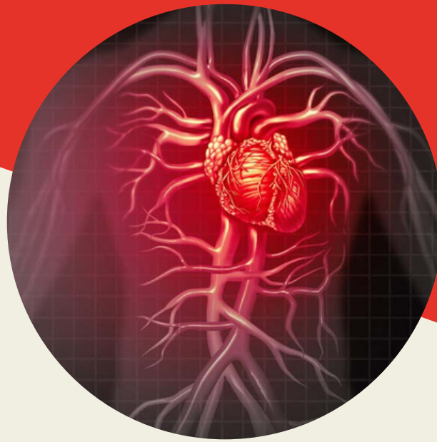
PREVENTION OF HEART DISEASE AND STROKE